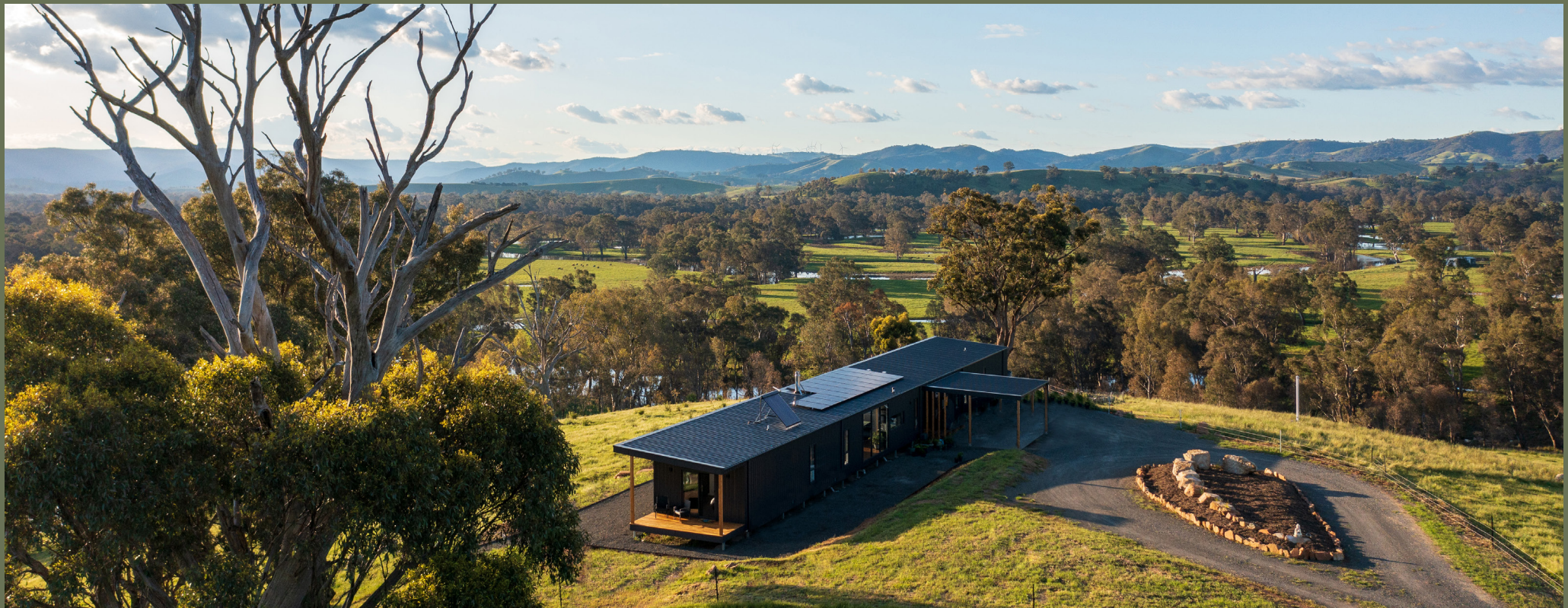
Ecoliv Yea Project - situated on the land of Murrindindi/Taungurung people