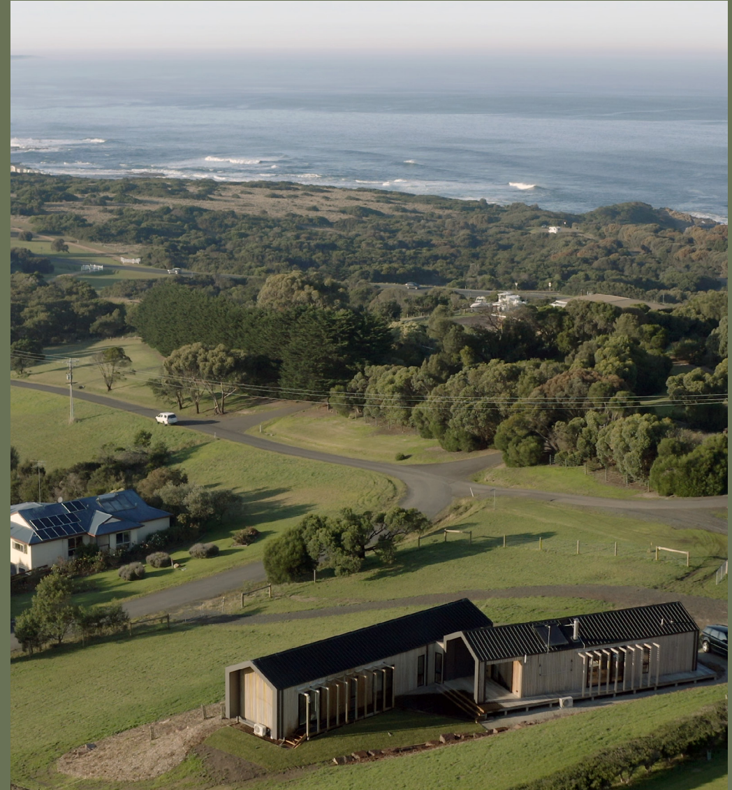
Ecoliv Kilcunda Project - situated on the land of Bunurong/Boon Wurrung people

Moving forward, Ecoliv is dedicated to developing partnerships, activities and sponsorships that support the spirit of our Reflect RAP implementation.